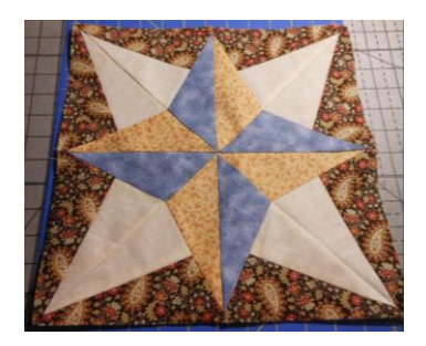
12 1/2" unfinished block