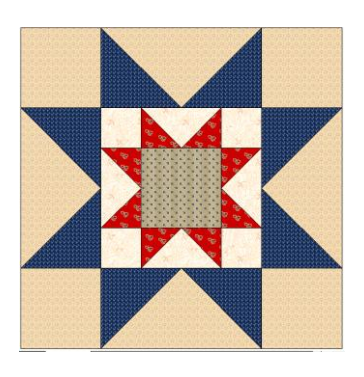
12 1/2" unfinished block