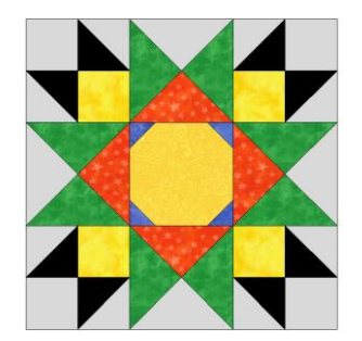
12 1/2" unfinished block