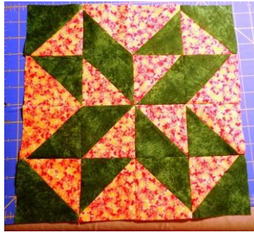
12 ½" unfinished block